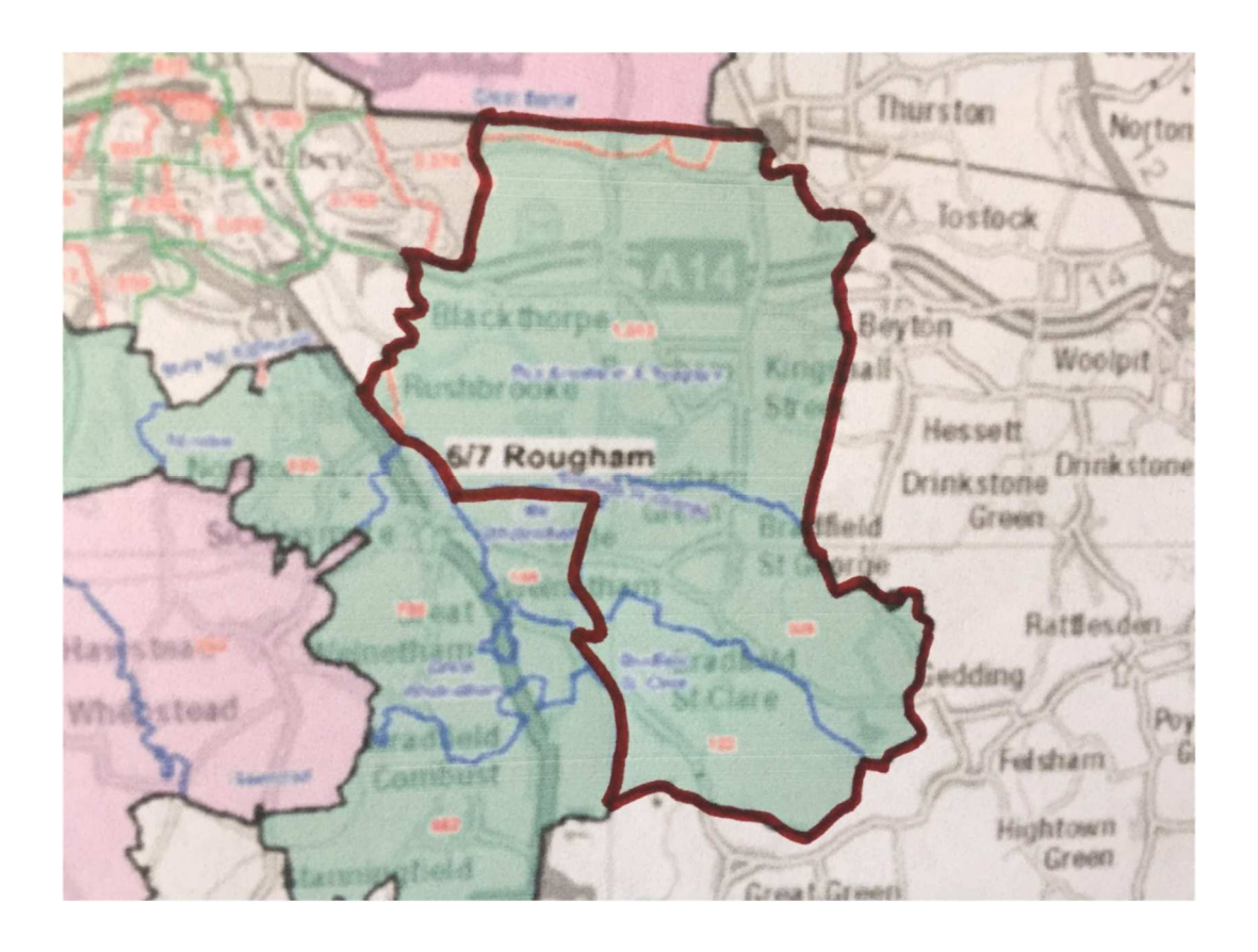
Appendix A: Proposed new Ward